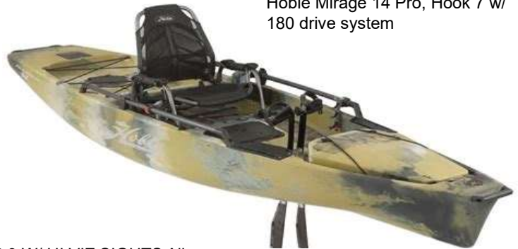
Hobie Mirage 14 Pro, Hook 7 w/ 180 drive system