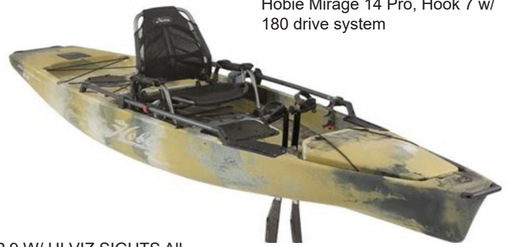
Hobie Mirage 14 Pro, Hook 7 w/ 180 drive system